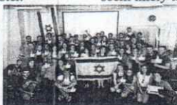
Photo of group that participated in Act.IL training

The Forward predicts: "Initiatives in cyberspace seem likely to increase."